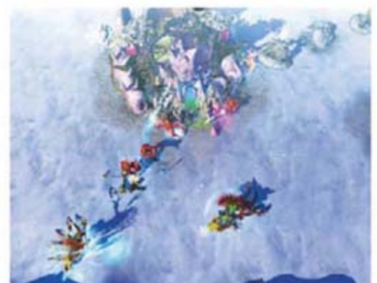
• Finishing the enemy base.