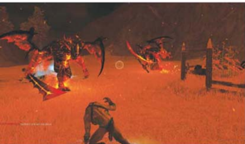
• If the sky fills with embers and demons start popping up out of nowhere, you did something wrong.

○ ○ ○ ○ ○ LIKE MOST MULTIPLAYER GAMES, SAVAGE 2 SUCCEEDS NOT BECAUSE OF WHAT YOU FIGHT FOR. BUT HOW YOU FIGHT FOR IT.