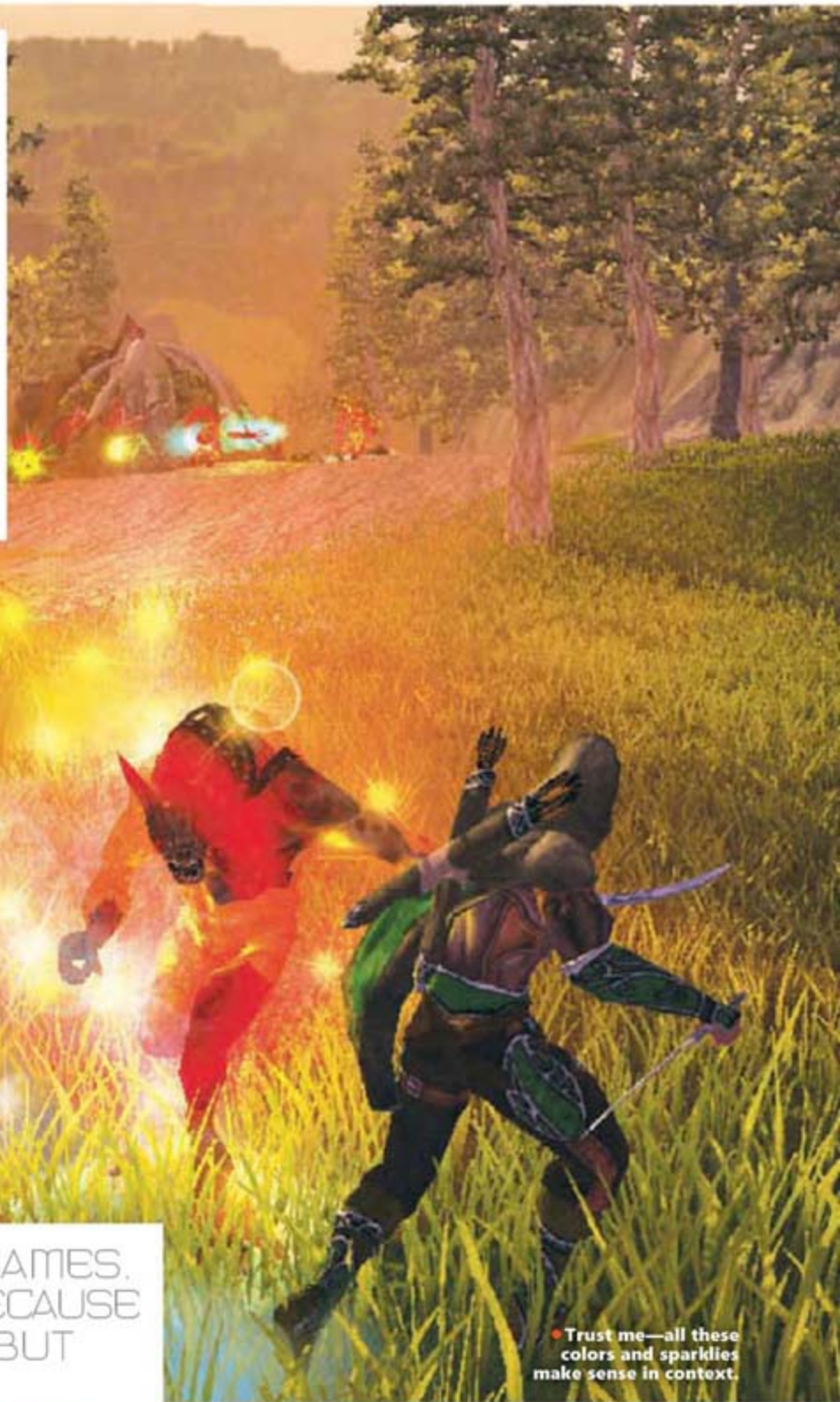
Trust me—all these colors and sparklies make sense in context.

○ ○ ○ ○ ○ LIKE MOST MULTIPLAYER GAMES, SAVAGE 2 SUCCEEDS NOT BECAUSE OF WHAT YOU FIGHT FOR. BUT HOW YOU FIGHT FOR IT.