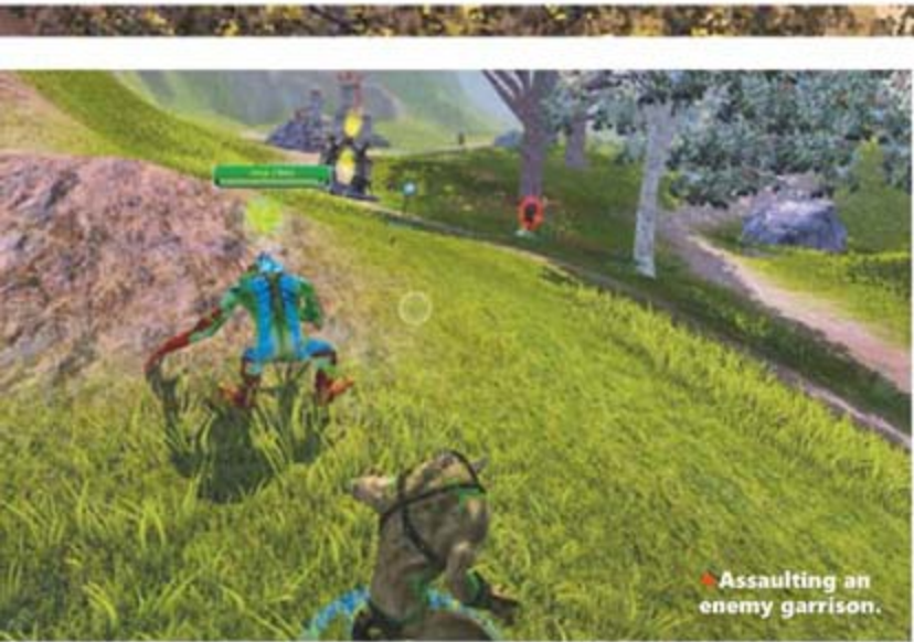
Assaulting an enemy garrison.