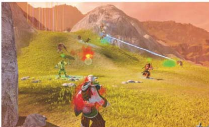
• The battle for Incredibly Generic Hill.